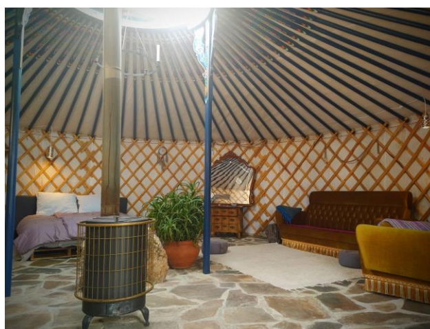
In winter time the yurt is heated by a wood stove

Contact us on what's app to check availability +34 621243747