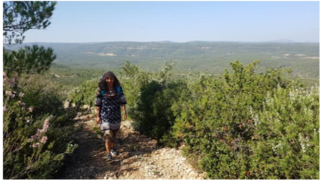
Mirador del Majo