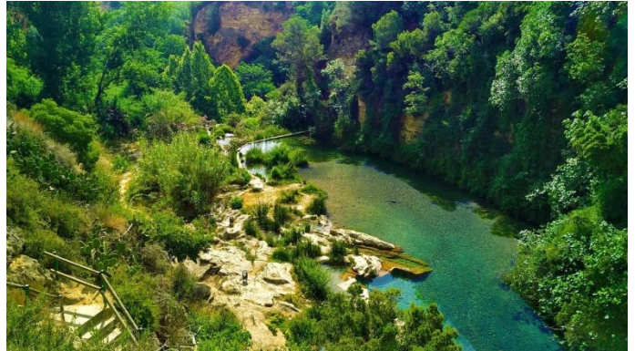
Gorgo de la Escalera