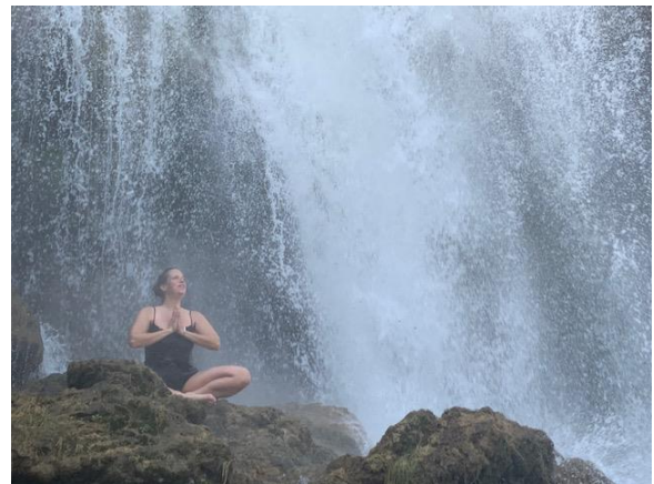
Cascada de los Vikinges