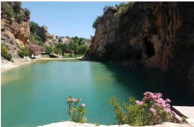
Rio de Bolbaite